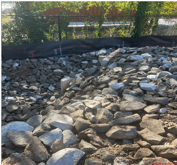
Riprap at A1 Headwall