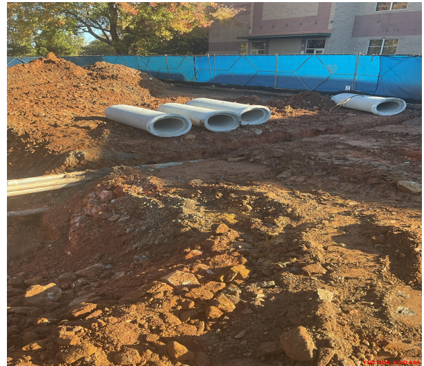
Installing pipe at Phase 1