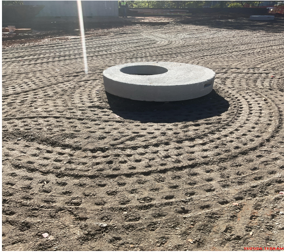
GAB installed on top of the #57 stone & fabric